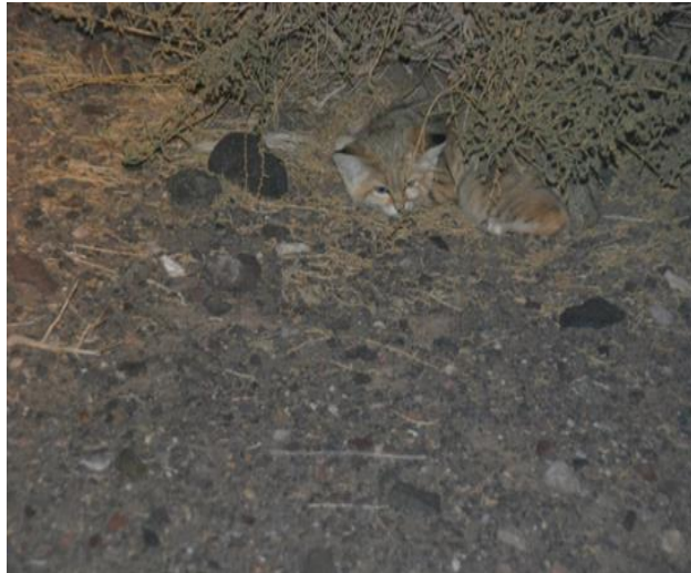
Figure 1. F. margarita in the study area