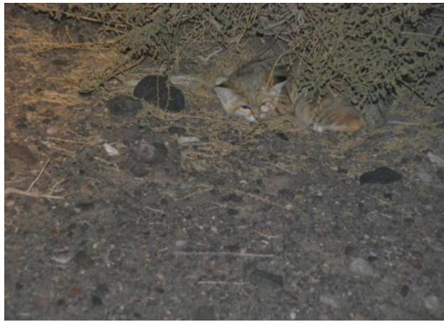
Figure 1. F. margarita in the study area

observed. To estimate population size and density, software packages including Distance ver. 6.2 and SPSS ver. 22 were used.