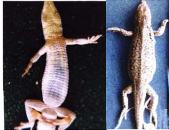
Figure 3. Eremias intermedia ; dorsal view of adult specimen showing the color pattern and ventral view showing the ventral scales arrangement.

homogeny, sexual dimorphism was analyzed using one way variance analysis.