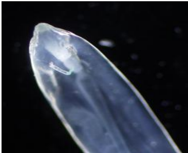
Figure 1. Mushroom-shaped structure at the anterior end of the muscular esophagus of Oswaldofilaria chlamydosauri

behind the cephalic extremity, up to the anus. The oral opening is not surrounded by lips. Additionally, the caudal alae is narrow or absent; and the body is swollen at the excretory sinus (Fig 1.). According to Pereira et al. (2010), the female O. chlamydosauri (redescribed by Manzanell 1982) has a long tail but the male possesses a distinctly attenuated tail, a gubernaculum, and the left spicule has a membranous extremity. The buccal cavity is laterally flat and deirids are absent in both sexes (Figs. 1 and 3).